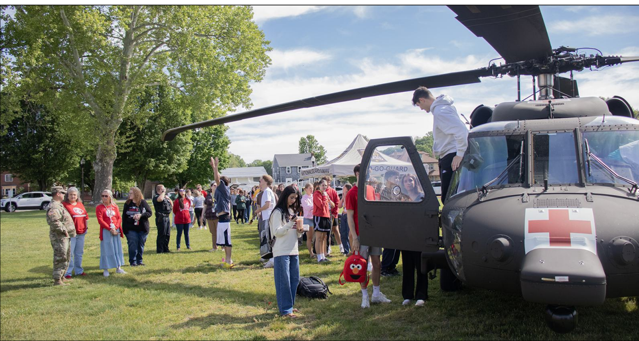
Students at Parkersburg High School line up to have the chance to sit in a HH60 Black Hawk Helicopter Friday