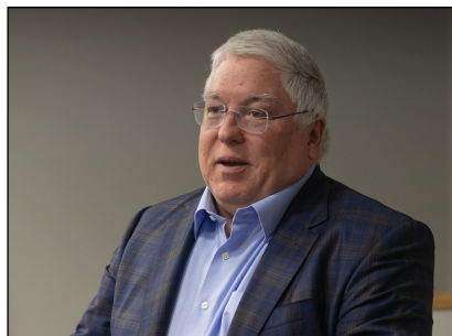
Gov. Patrick Morrissey shares his hopes for the collaboration between medical centers and the Rural Health Transformation Program Friday afternoon.