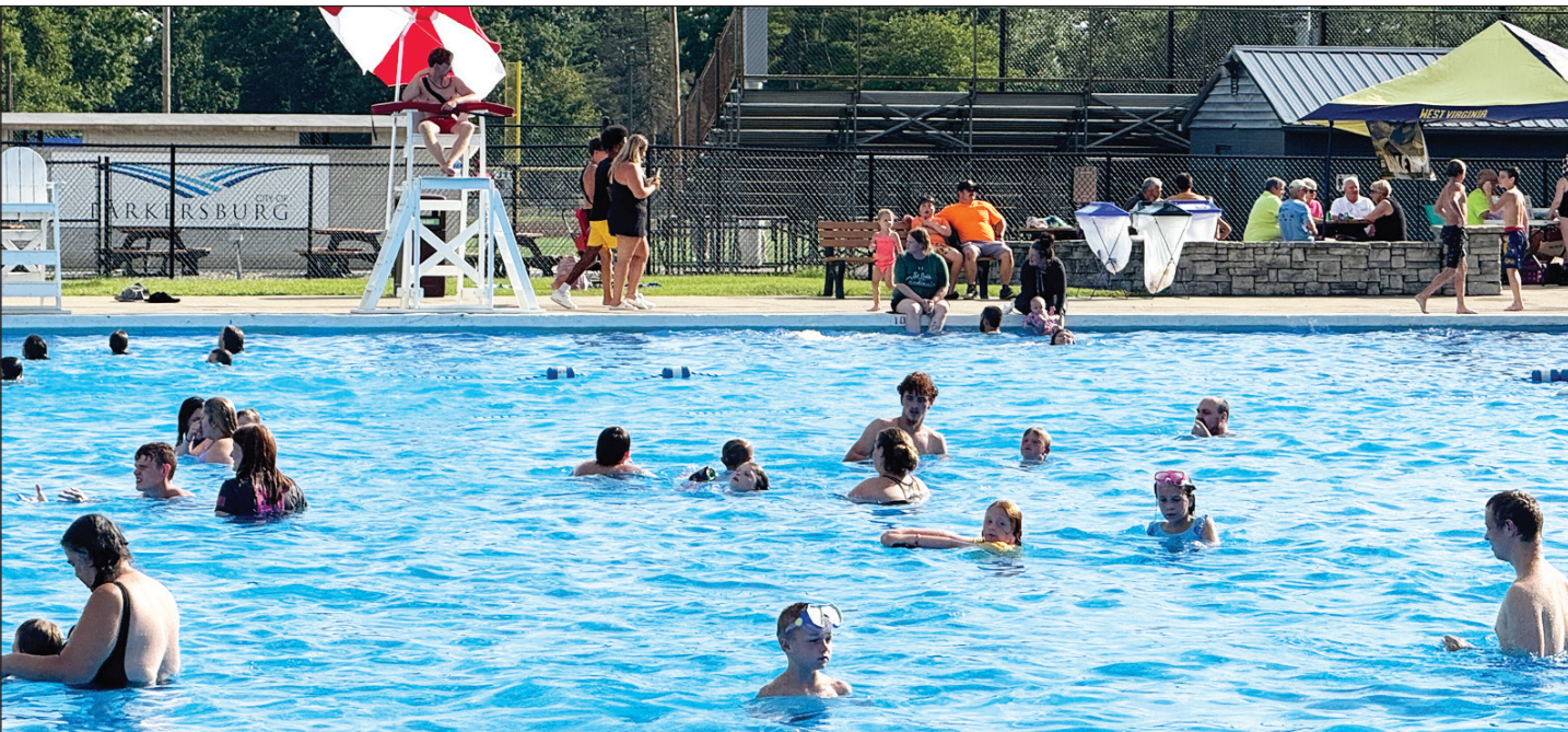
The Parkersburg City Park pool was open free to the community from 5 to 8 p.m. Tuesday for the National Night Out annual event. Parkersburg held its ninth annual National Night Out on the first Tuesday of August.