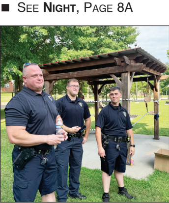
Police with the Parkersburg Police Department met with the community at the pool during National Night Out on Tuesday.