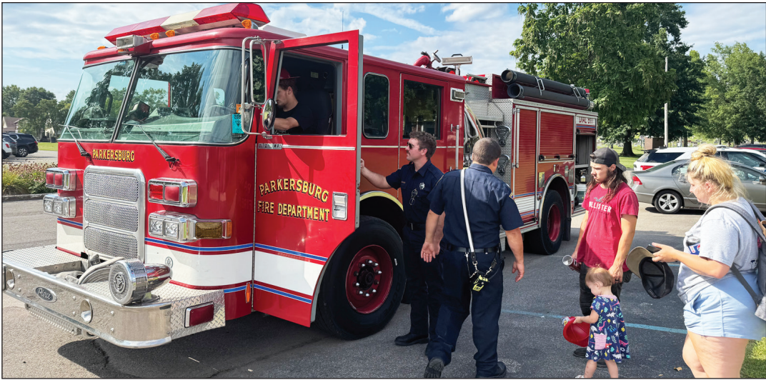
ABOVE: Firefighters with the Parkersburg Fire Department helped show kids how to drive the firetruck at National Night Out on Tuesday. BELOW: The splash pad at the Parkersburg City Park was open from 5 to 8 p.m. for free for those attending the National Night Out on Tuesday.