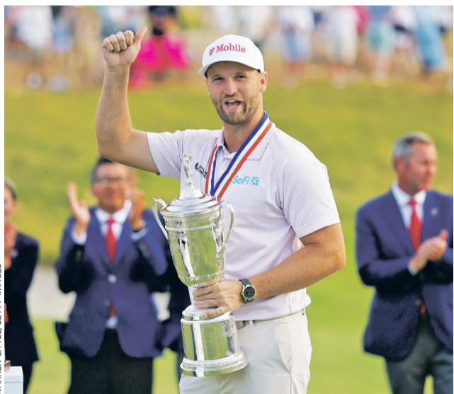
UNDER CONTROL: After leading by six strokes through 54 holes, Wyndham Clark kept his cool and finished one stroke ahead of Sam Burns at the U.S. Open on Long Island, N.Y. A18