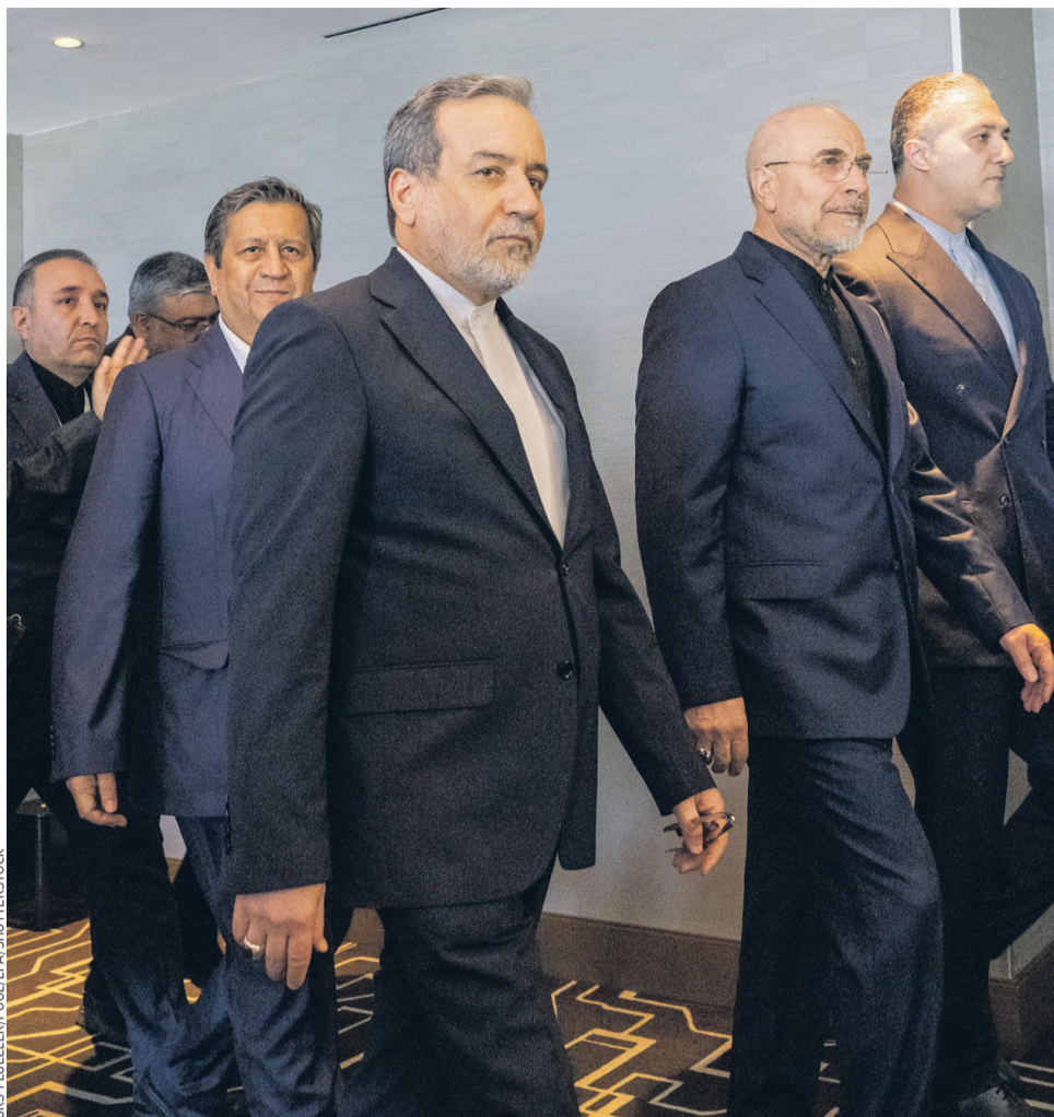
Iran's minister of foreign affairs, Abbas Araghchi, center, and members of his team Sunday conducted negotiations with the U.S. delegation in Bürgenstock, Switzerland.

© 2026 Dow Jones & Company, Inc. All Rights Reserved