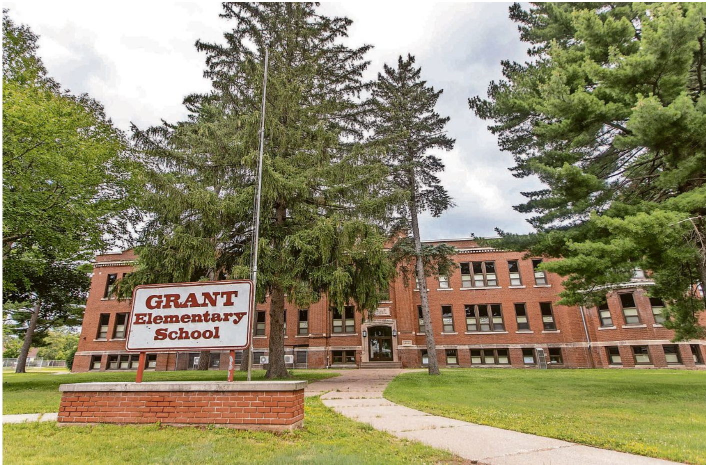
Grant Elementary School, 500 N. Fourth Ave. in Wausau, is pictured in 2024.