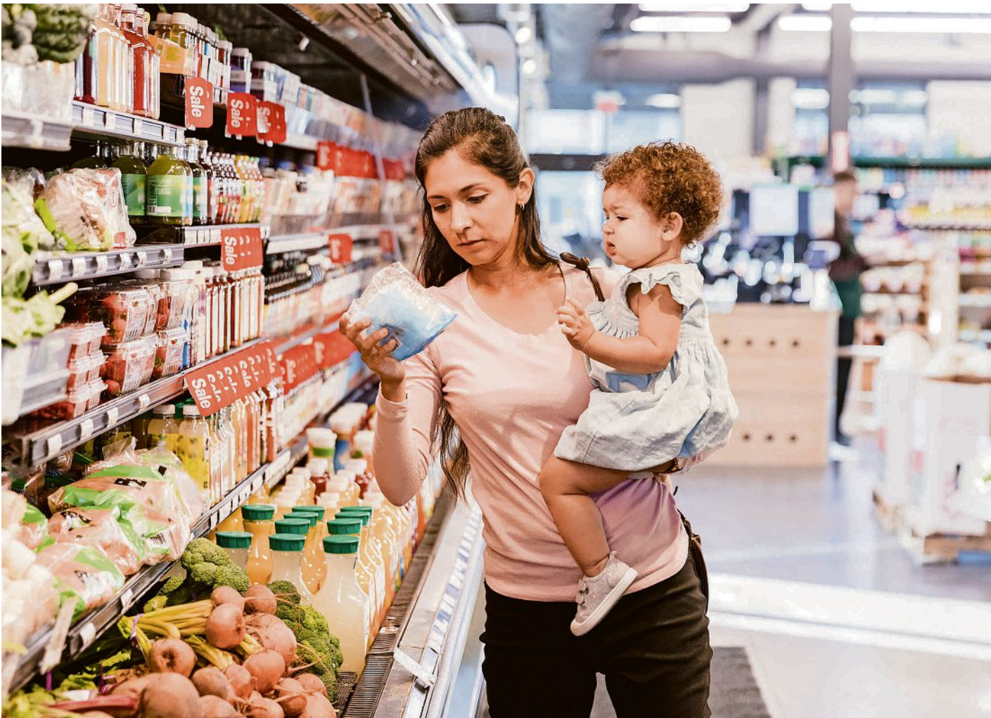
SNAP-Ed taught people how to identify healthy food patterns, keep food safe and navigate a complex food environment. It also taught low-income Americans how to improve their budgeting and planning for meals that balance cost and nutrition.