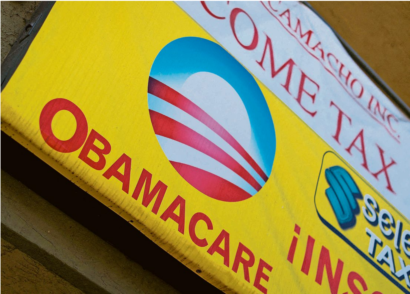
A sign on an insurance store advertises Obamacare in San Ysidro, San Diego, CA, October 26, 2017.