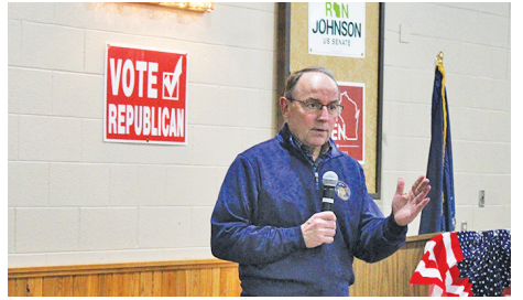
Lincoln Day Dinner PAGE 12