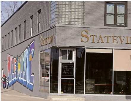
Stateview Commons, at 532 W. College Ave. in Appleton, no longer has a valid license to operate as a tourist rooming house.

Due to the upcoming Presidents Day holiday, there will be no mail delivery on Monday, Feb. 16. Instead of receiving your Feb. 16 paper on Monday, you’ll receive it in the mail on Tuesday, Feb. 17.