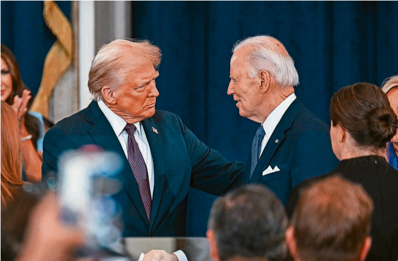
President Donald Trump, left, and outgoing President Joe Biden attend Trump's inauguration in Washington on Jan. 20, 2025.