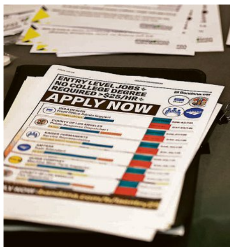
The latest Job Openings and Labor Turnover Survey indicated that hiring jumped in March to its highest level since February 2024.