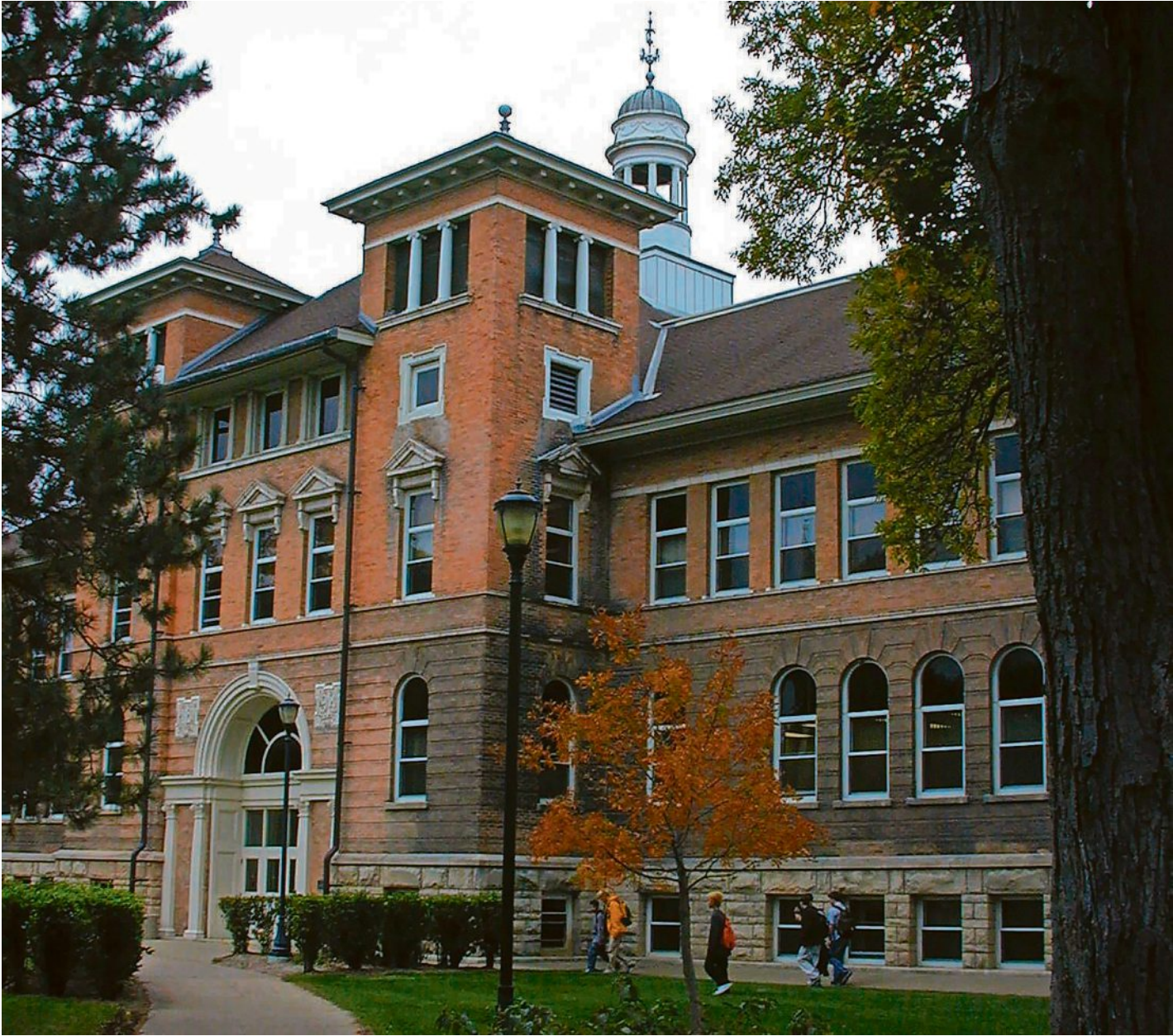
Old Main on campus at the University of Wisconsin-Stevens Point.