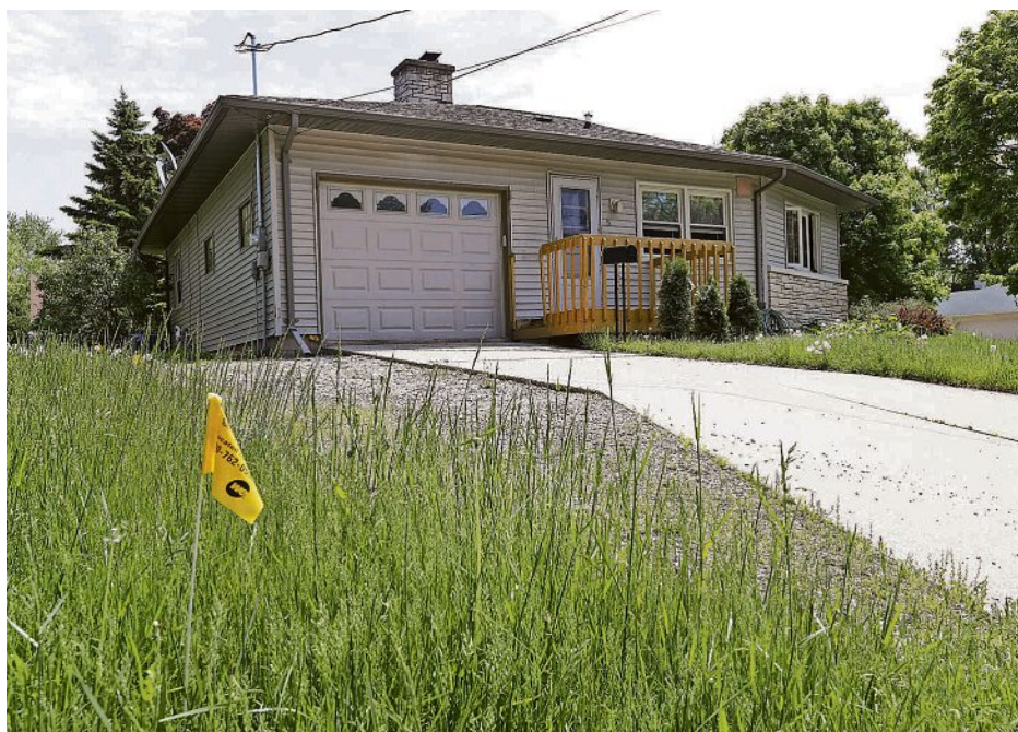
Appleton restricts the height of grass and weeds to 8 inches on developed lots, but that wasn't the case when the city experimented with No Mow May in 2020.