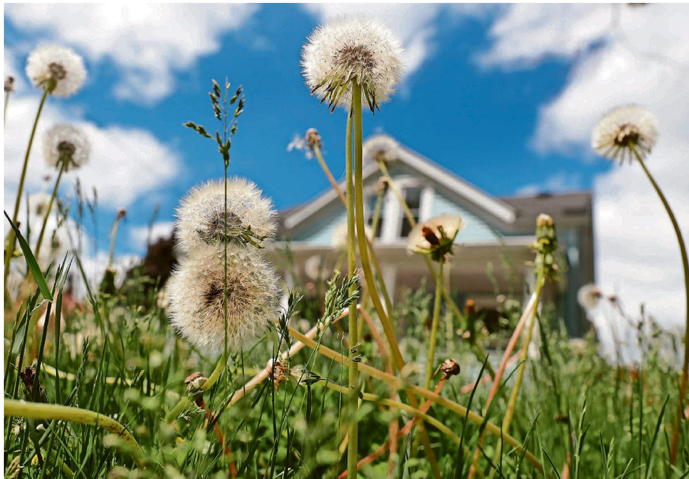
Grass and dandelions grow tall during Appleton's experimentation with No Mow May in 2020.