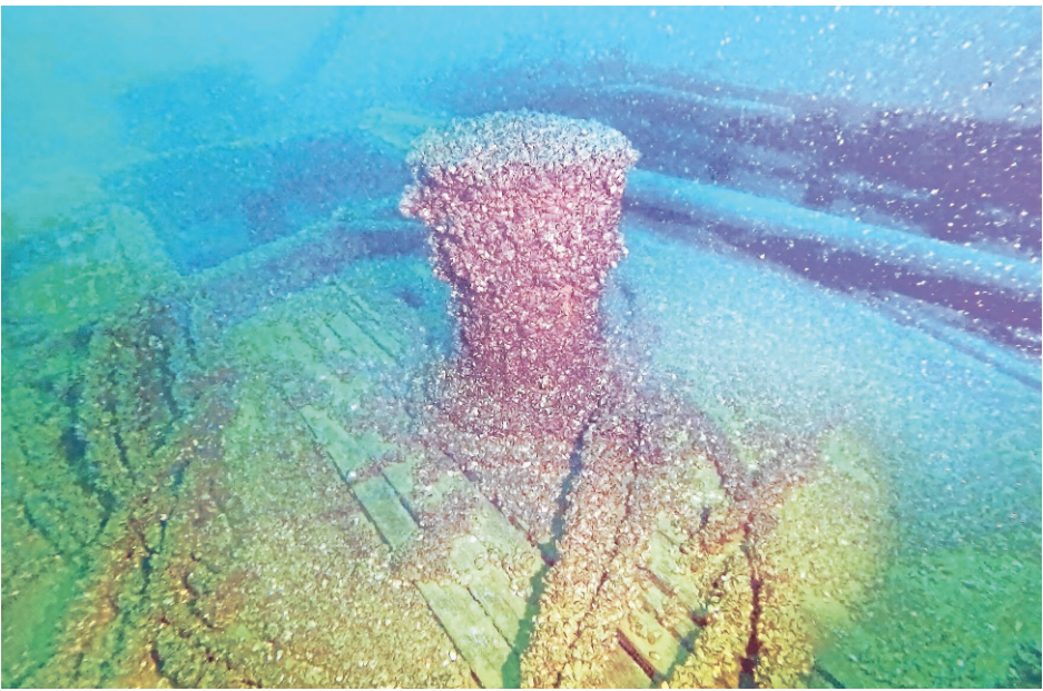
Please see SHIPWRECK , Page A3 Quagga mussels cover the capstan of the F.J. King shipwreck in Lake Michigan on Aug. 23.