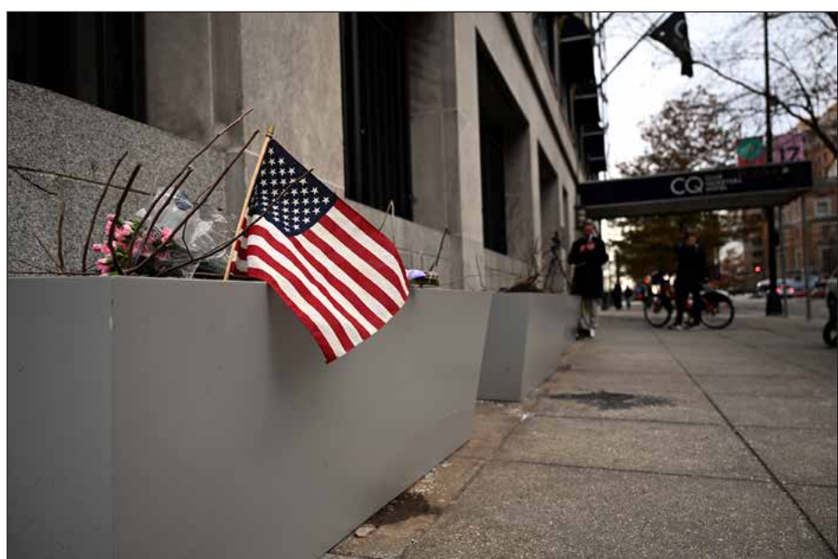
Mourners set up a makeshift memorial of for two National Guard service members near the Farragut West Metro station on Thursday in Washington, D.C.