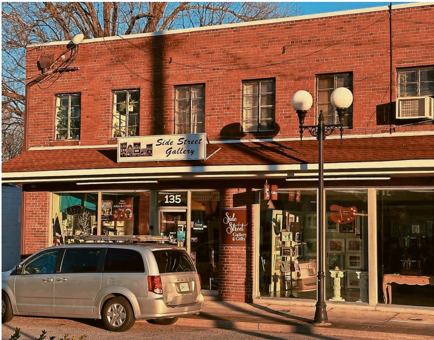
Side Street Gallery, a nonprofit, in Colonial Heights.