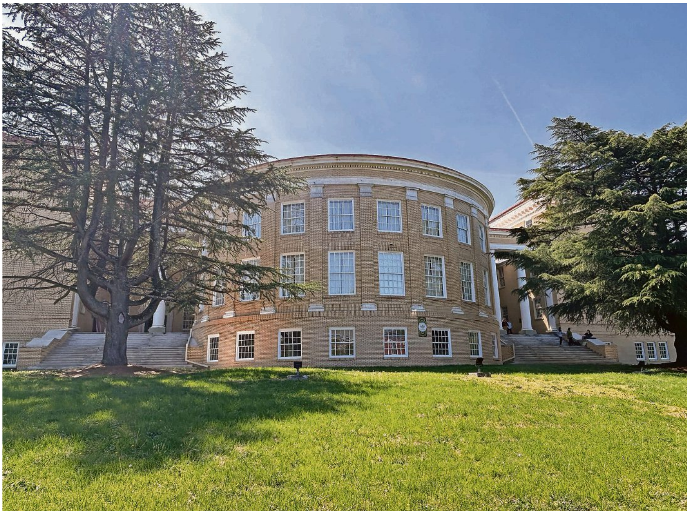
Appomattox Regional Governor's School opened in 1999 in the former Petersburg High School on West Washington Street.