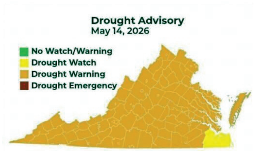
A map shows drought conditions across Virginia as of Thursday, May 14, 2026.