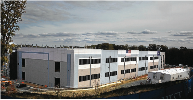
PETER CIHELKA, THE FREE LANCE-STAR

Shown in November, the Potomac Church Tech Center, along Old Potomac Church Road near Stafford Hospital, is one of five data center projects approved before Stafford County adopted stricter regulations in October.