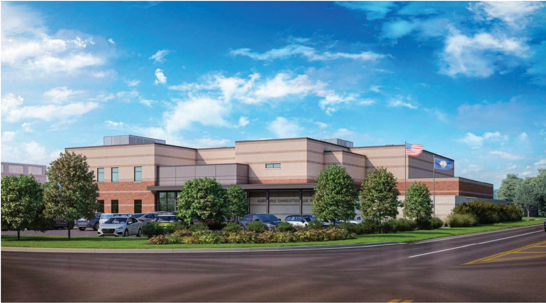
ALBEMARLE-CHARLOTTESVILL REGIONAL JAIL

A rendering shows planned renovations to the Albemarle-Charlottesville Regional Jail.