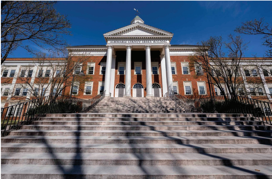
UNIVERSITY OF VIRGINIA

The Albemarle County Office Building is located at 401 McIntire Road in downtown Charlottesville.