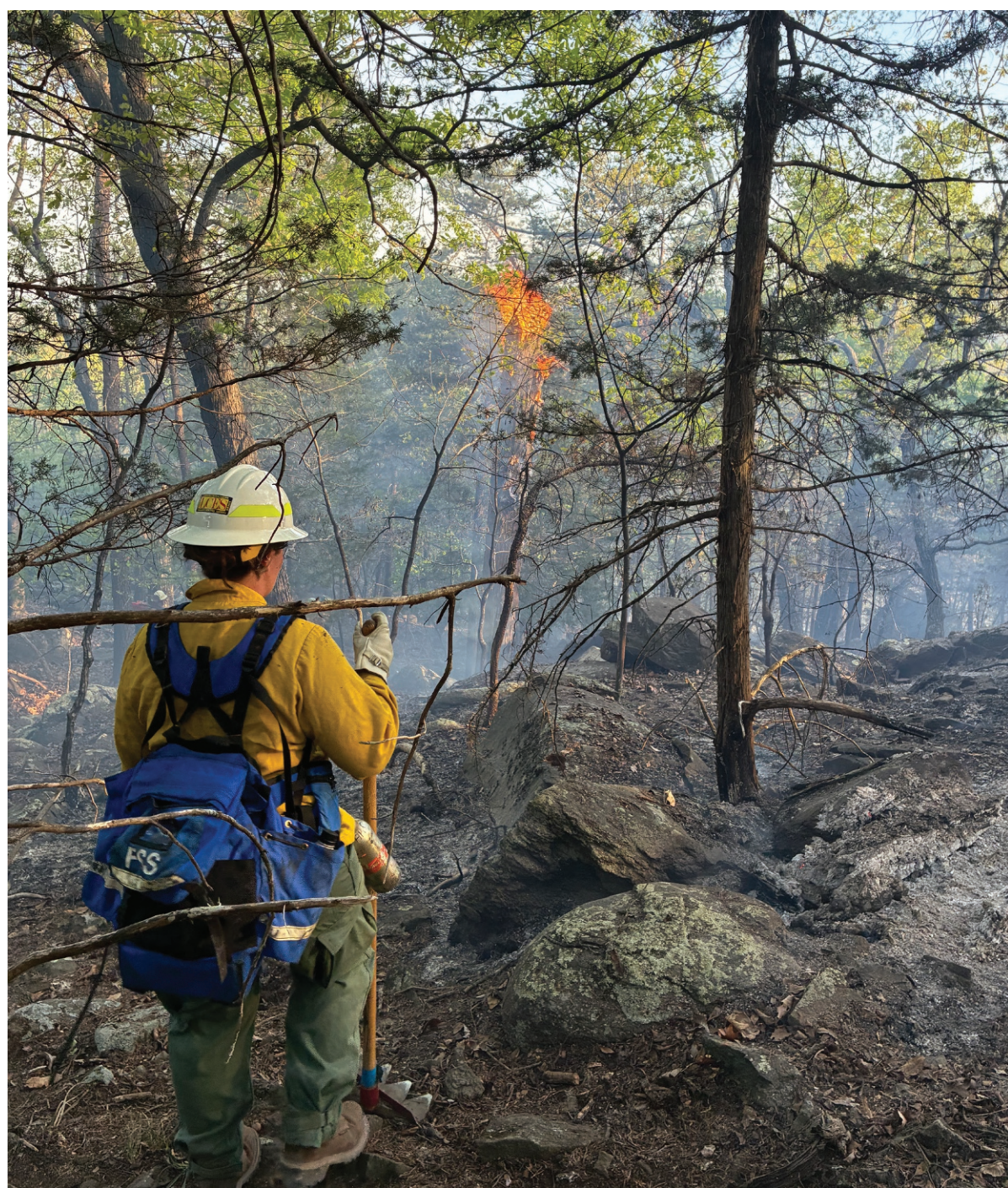
CHANGE TO VIRGINIA DEPARTMENT OF FORESTRY

A Virginia Department of Forestry firefighter helps monitor flame Monday on Mount Pony.