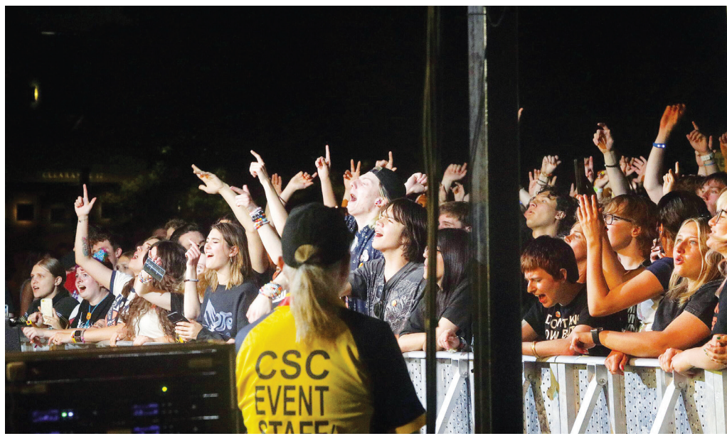
Fans sing along with IDK But They Found Me during the Rooftop Concert Series on Friday in Provo.

took the stage, we were in full Audubon mode. What a THRILL. With full trust in lead singer Dallon Weekes in the driver's seat, we all came