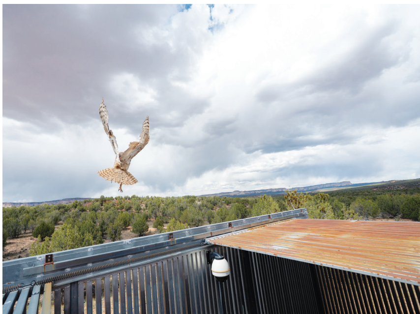
A great horned owl flies to freedom after surgery at Best Friends Animal Sanctuary in Kanab on May 1.