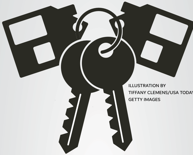
ILLUSTRATION BY TIFFANY CLEMENS/USA TODAY; GETTY IMAGES

Innovative mortgage financing could revolutionize the big move