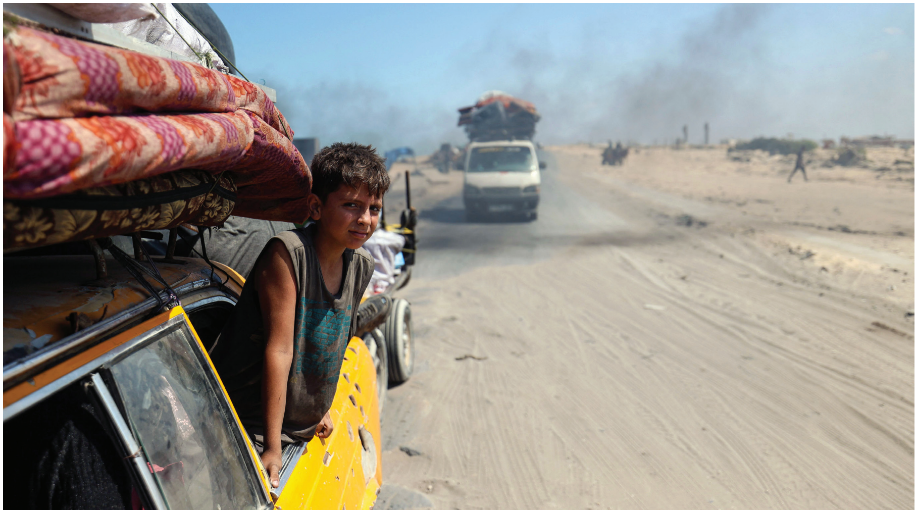
A displaced Palestinian boy flees south from Gaza city with his family on Thursday after the Israeli military issued eviction orders. Reports, pages 2-3