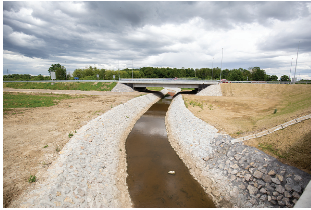
Victoria City Council members discuss a proposed stormwater drainage fee during Tuesday's meeting, where public hearings on the ordinance were postponed to allow for additional review and a future town hall discussion. (FILE PHOTO)

In connection with the Community Center expansion, council members approved a contract with CivilCorp, LLC for final surveying and design