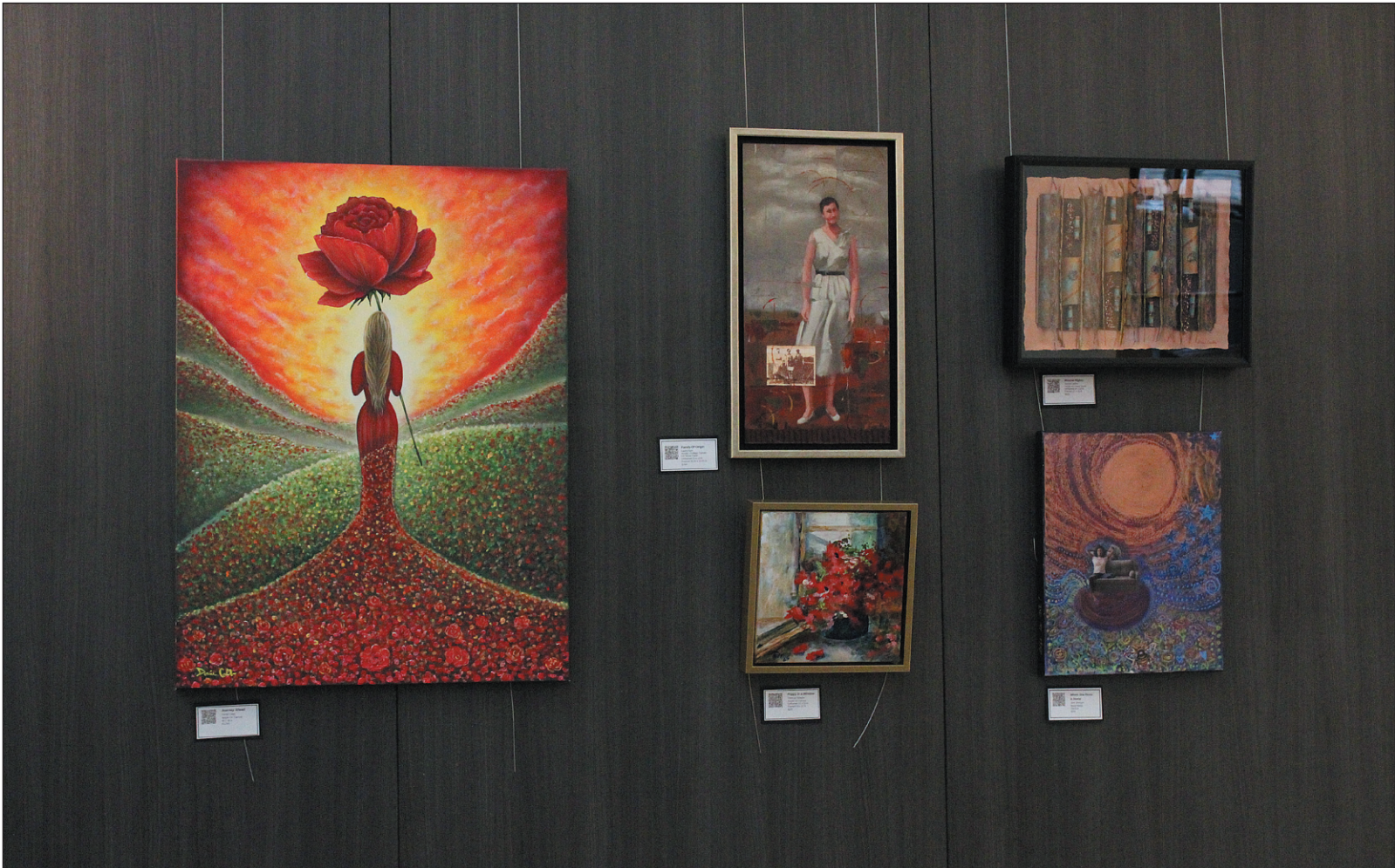
A collection of featured works, including oil and mixed media pieces, adorns the walls of Gallery Main Street. The exhibit is open to the public during the gallery’s extended evening hours, providing a cultural hub in the heart of downtown Tyler.