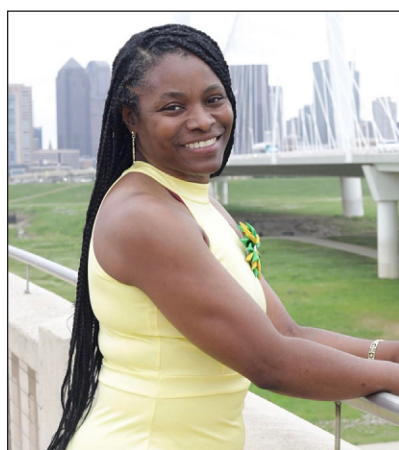
From Staff Reports

The Shady Grove Missionary Baptist Church will honor veterans and active-duty military personnel during a special Armed Services Day program set for Saturday, May 16, at 7 p.m. at the church, located at 6132 State Highway 315 in Long Branch.