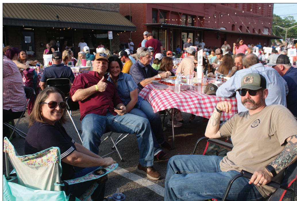
Attendees gather in downtown Carthage for the annual Tunes & Tails event April 25, featuring live music, crawfish and community activities.