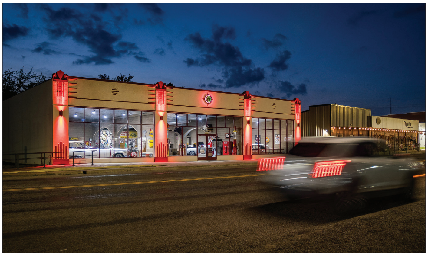
The lit-up exterior of East Texas Speed is seen May 29 on Main Street in downtown Gladewater.

East Texas Speed, with its antiques and classic cars, is another piece in downtown Gladewater's revitalization