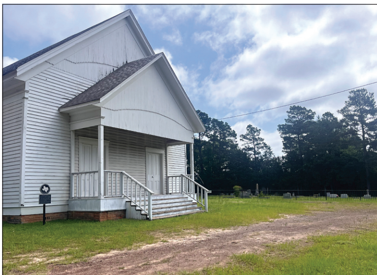
LaGrone Chapel Baptist Church has been ordered to vacate its historical property in Hallsville.

MARSHALL – A Harrison County court has ruled a Baptist congregation must vacate an historical church property in Hallsville.