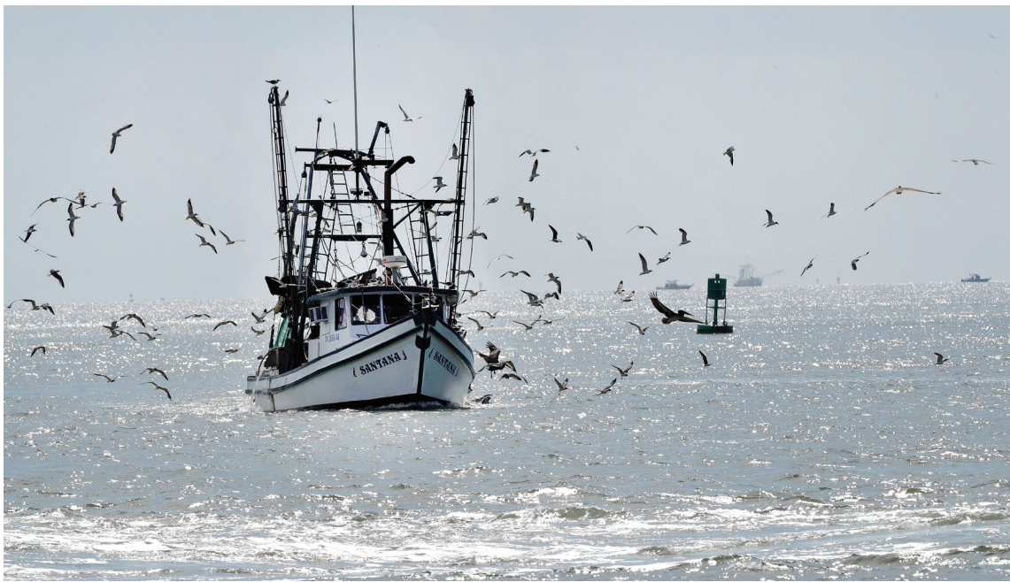
Birds flock to the Santana in search of a free meal Monday as the shrimp boat turns into the Galveston Ship Channel.