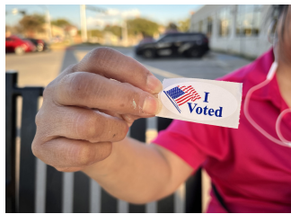
A Denton County voter holds up her "I Voted" sticker after casting a ballot in 2024.

Out of about 667,800 registered voters in Denton County, about 171,000 cast a ballot in the primaries, according to numbers from Denton County Elections Administration. That's about 25.6% voter turnout overall. Texas has open prima-