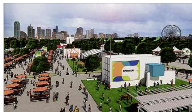
North Texas FWC Organizing Committee

"We realize that there are people who may not be able to attend a World Cup