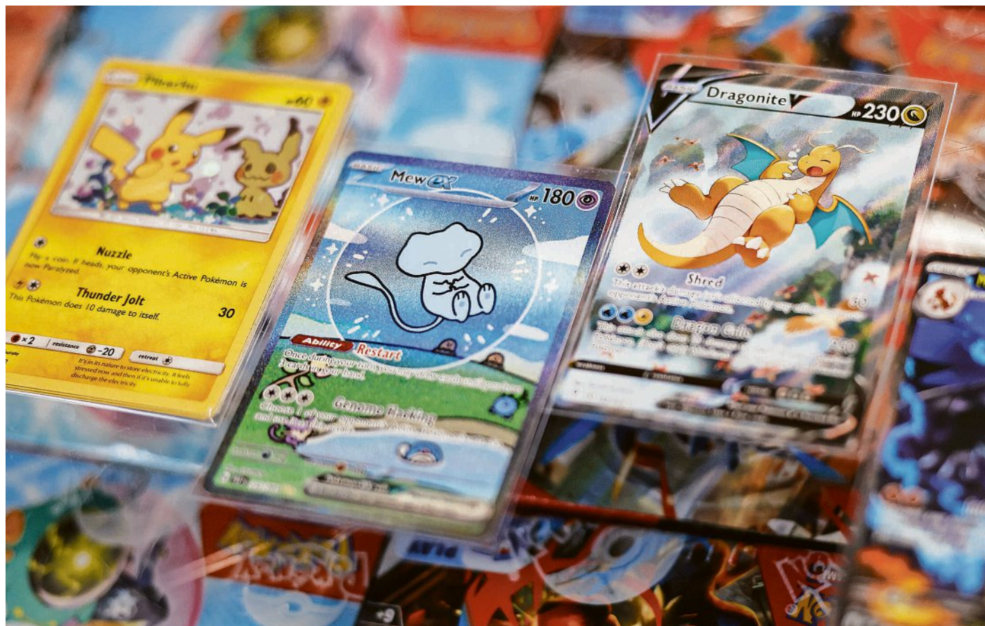
The Harbor City Card Convention will be held for three days starting July 10 at the Hilliard Center, where attendees will be able to buy, sell and trade collectible cards.