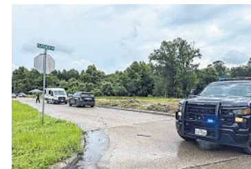
Beaumont Police Department

The investigation remains ongoing, and anyone with information is encouraged to contact the Beaumont Police Department at 409-832-1234 or Southeast Texas Crime Stoppers at 409-833-8477. Tips can also be submitted through the P3 Tips app. All Crime Stoppers tips remain anonymous, and tipsters may be eligible for a cash reward.