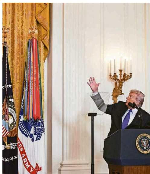
While updating reporters on the war in Iran, Trump stopped in the middle of his remarks to admire the White House curtains.

Jones, founder of Infowars and a long-time Trump supporter, said during a March