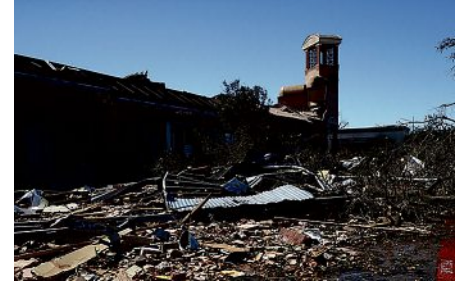
Debris litters the Preston Royal shopping area on Oct. 21, 2019 in Dallas, after a tornado caused major damage to homes, businesses and schools but no deaths or serious injuries were reported.