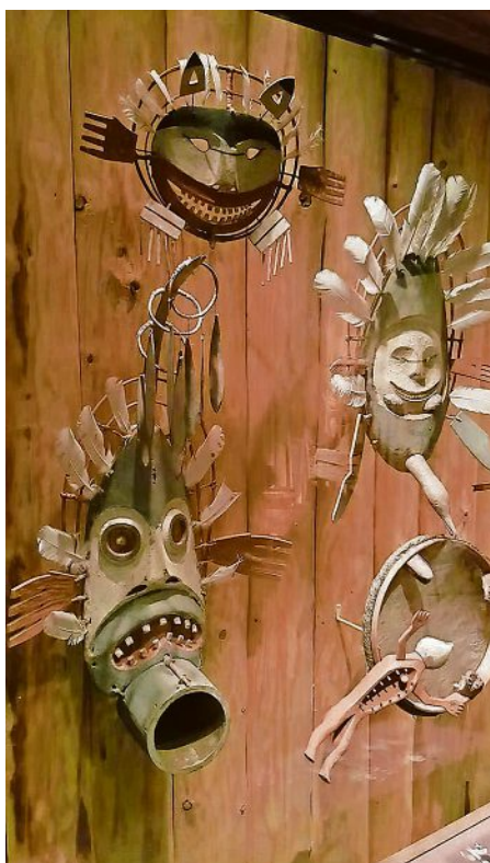
Yup'ik masks are displayed at the National Museum of the American Indian in Washington.