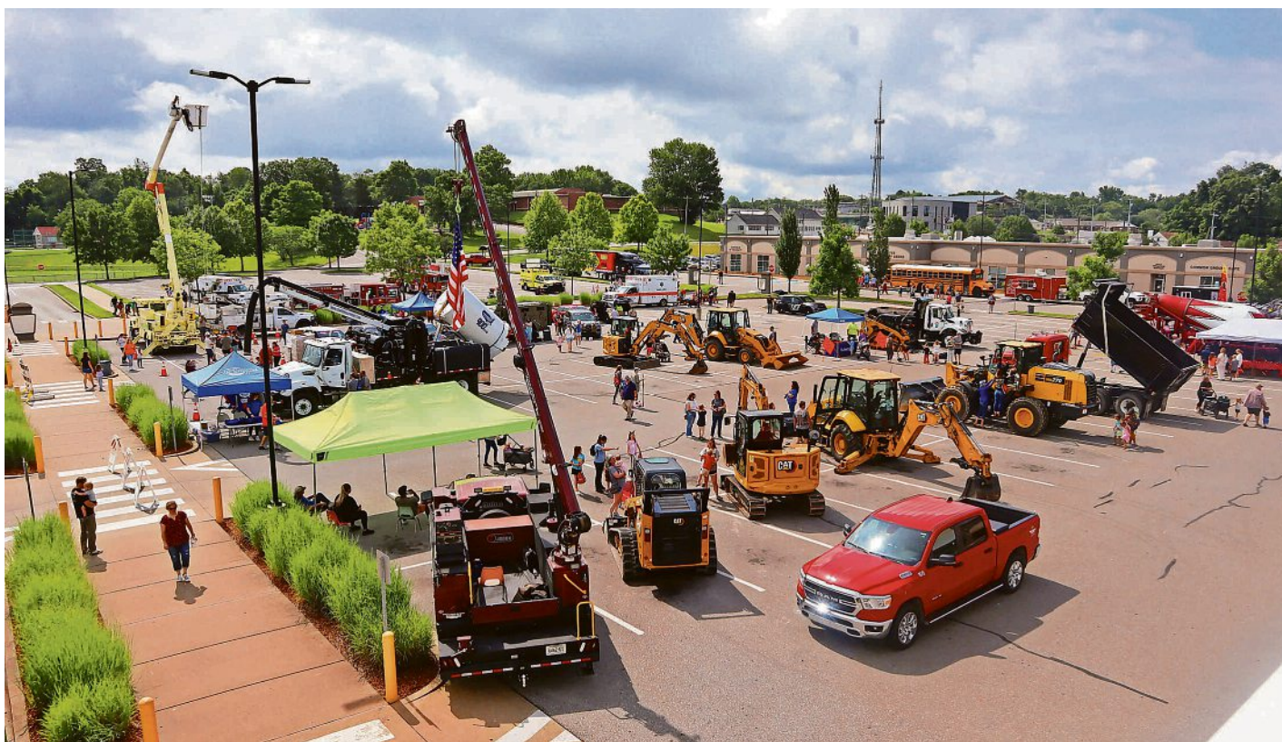
The Clarksville-Montgomery County Public Library’s annual Touch-A-Truck event allows residents to explore the trucks and meet the professionals who operate the emergency vehicles seen throughout the community every day.