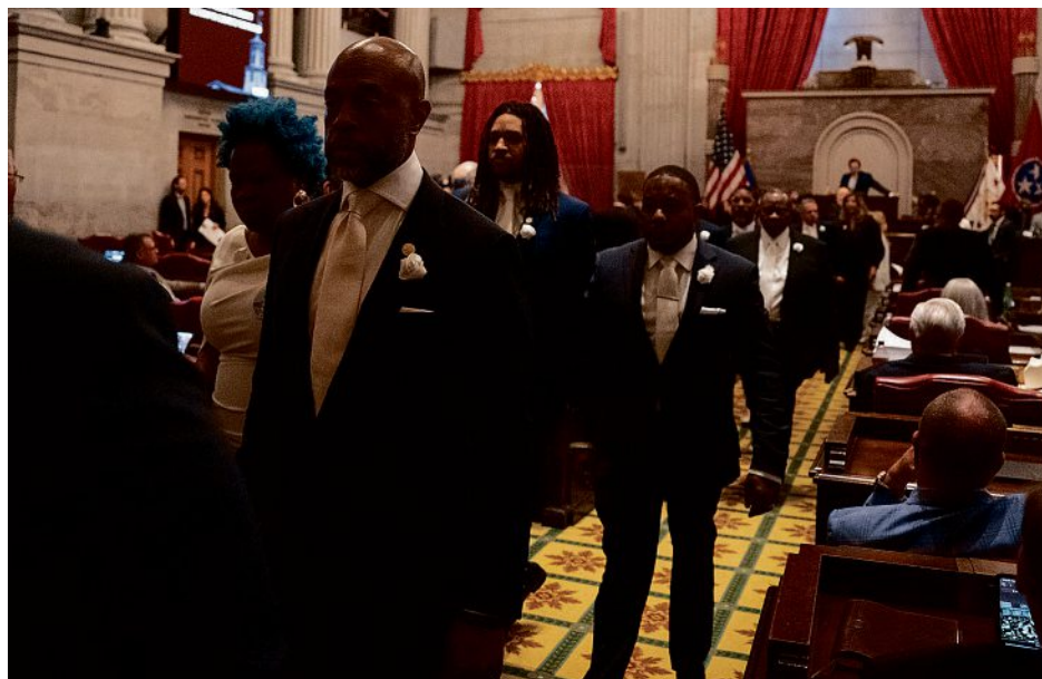
Democratic representatives walk off the House floor together on the third day of special session concerning redistricting at the Tennessee State Capitol Building in Nashville on May 7.