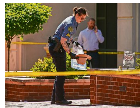
The aftermath of a shooting outside the Montgomery County Courthouse in Clarksville on May 13.