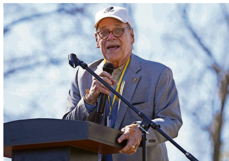
U.S. Rep. Steve Cohen speaks as part of a No Kings rally at Robert R. Church Park in Memphis on March 2.