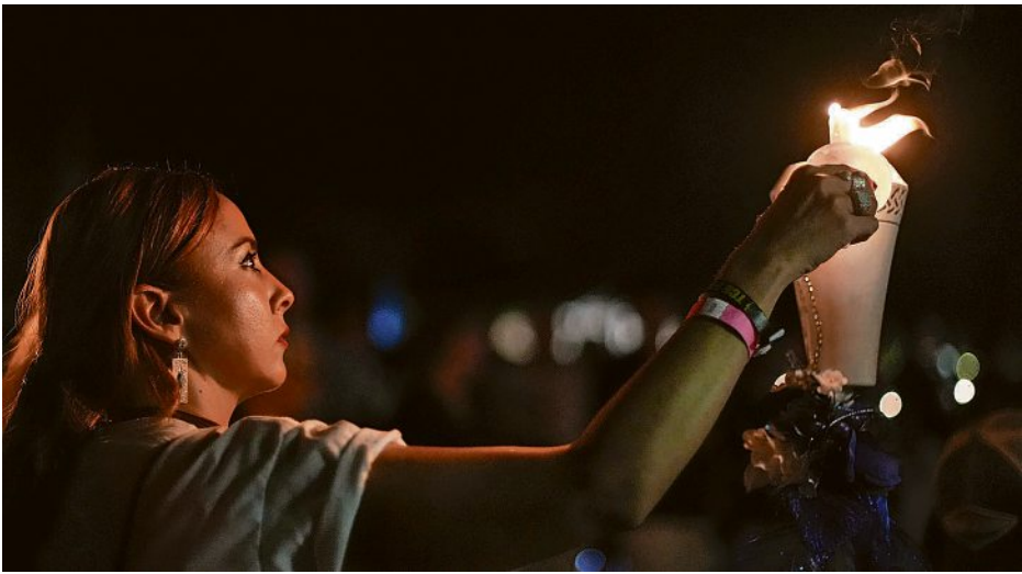
Fans light their candles from a torch before they walk up to the Meditation Garden and see the grave of Elvis Presley and other Presley family members during the Candlelight Vigil on Aug. 15 at Graceland in Memphis.

“Because the only thing you can take to the grave is — that ,” she said, extend-