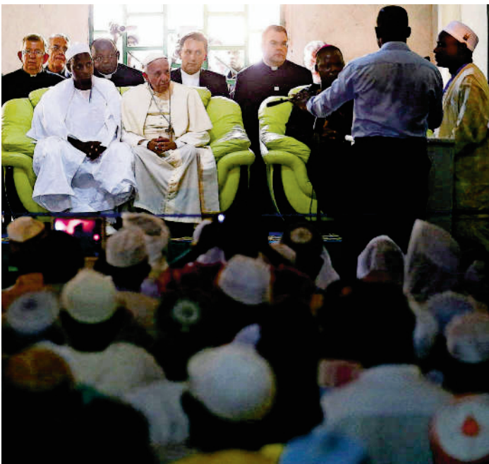
In a 2015 trip to the Central African Republic, Pope Francis visited both a Christian church and a mosque to promote the message of peace in the war-torn nation.