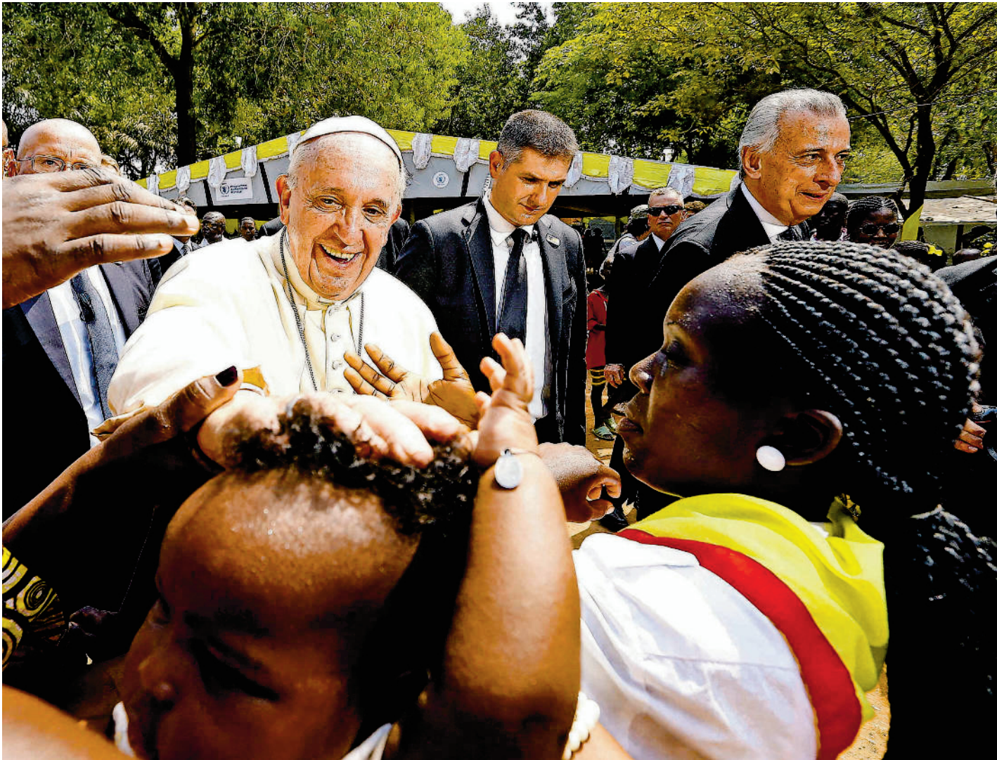
Pope Francis blesses a child at a refugee camp in Bangui, Central African Republic, in November 2015. Francis focused the Catholic Church and the entire world on one mission: helping the poor, addressing global inequalities and placing the attention of the world on those on the periphery.