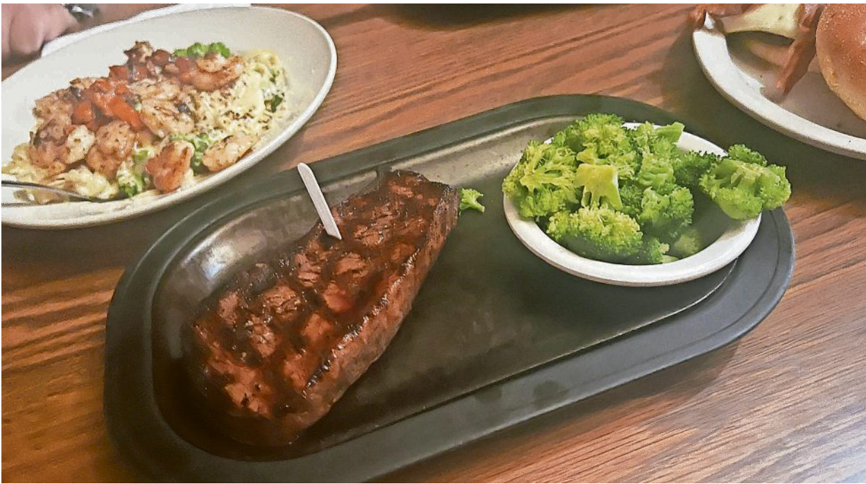
The Flame Steakhouse & Lounge is known for its charbroiled steaks; here one of its famous sirloins is ready to go to a customer’s table.