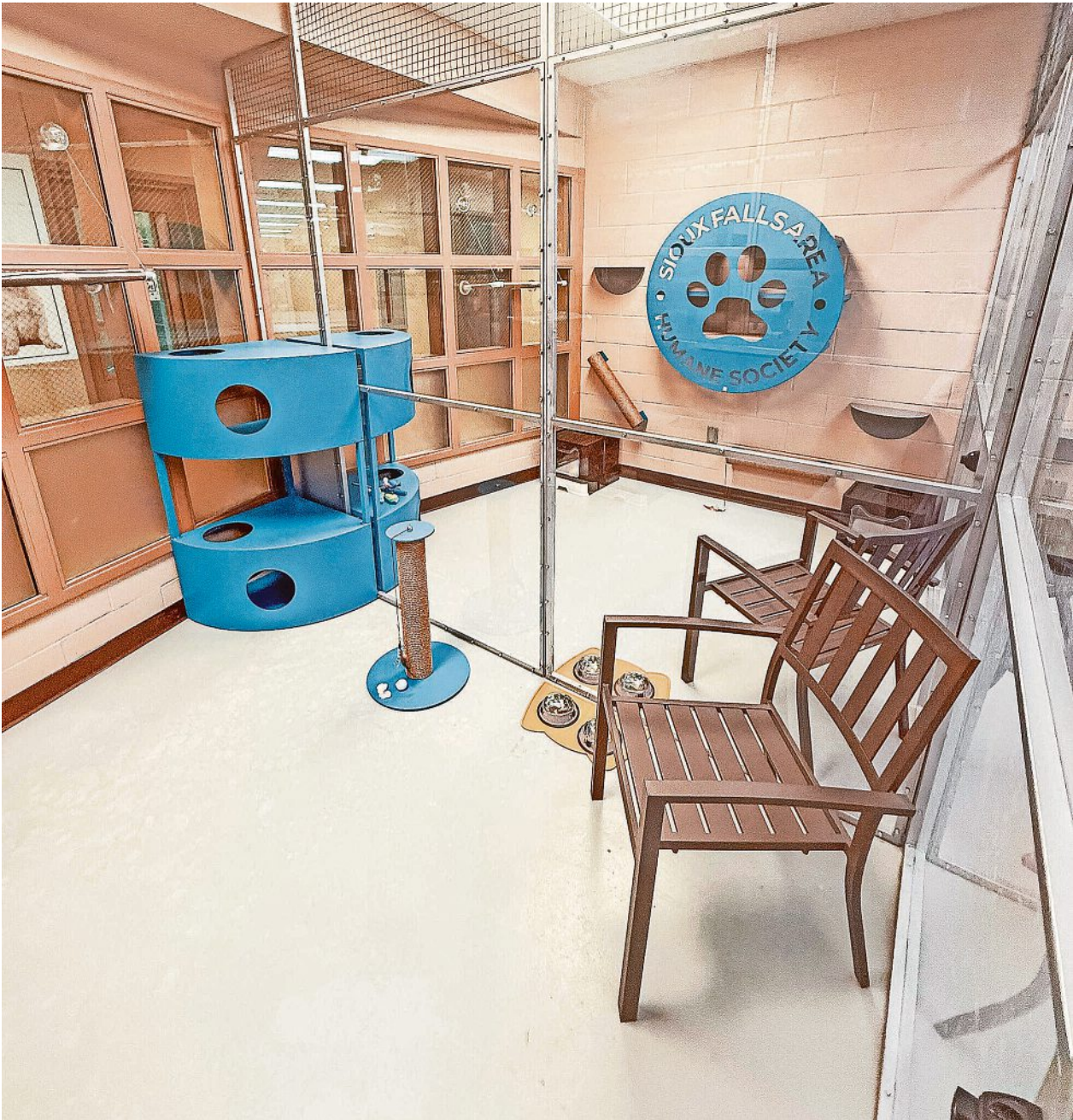
The newly expanded Cat Adopt Room at the Sioux Falls Area Humane Society underwent extensive renovations including redesigned cage layouts, custom-welded dividers to create two free-roaming cat rooms, new climbing structures, hiding spaces, interactive features and a designated treatment room for sick cats.