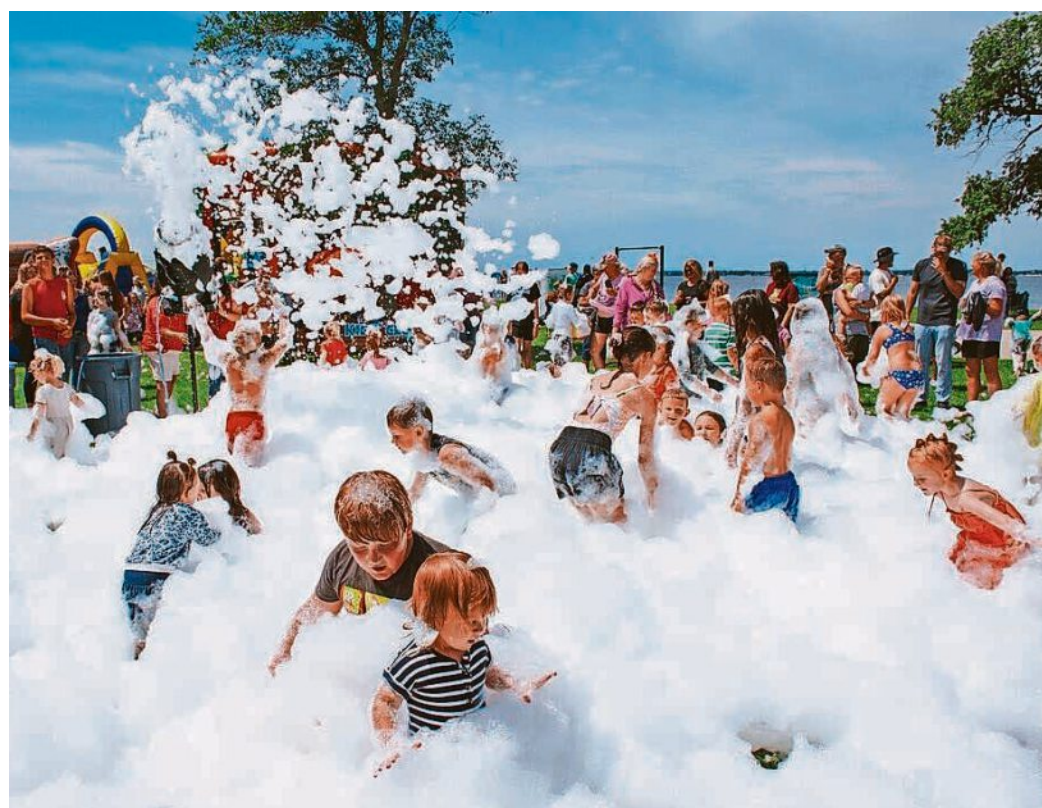
Lake Kameska will host the annual Cookin' on Kameska festival July 16-18.