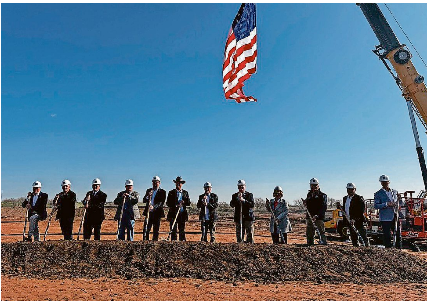
South Dakota Gov. Larry Rhoden poses with the Project Prison Reset Task Force on April 22 for the new prison site groundbreaking in Sioux Falls.