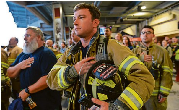
The National Fallen Firefighters Foundation 9/11 Memorial Stair Climb was held at Fluor Field in Greenville on Sept. 10, 2022. First responders observe a moment a silence at the event.