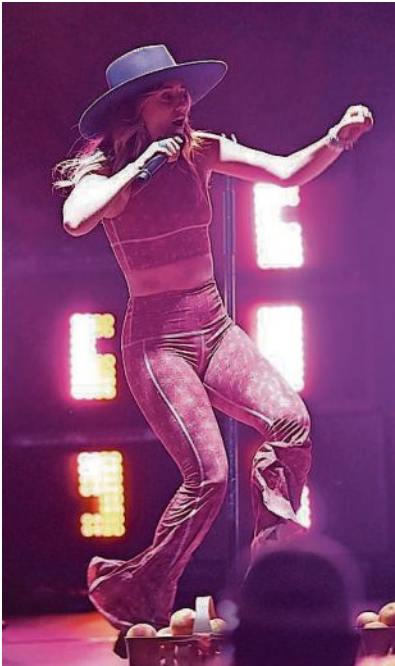
Country music sensation Lainey Wilson’s concert brought a large crowd to the SC Peach Festival in Gaffney on July 14, 2023.