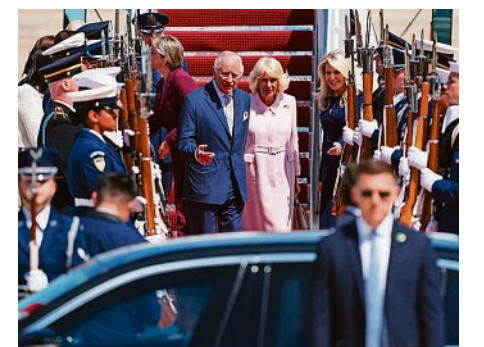
King Charles III and Queen Camilla disembark the plane on arrival for a state visit to the United States at Joint Base Andrews, Maryland, on April 27.