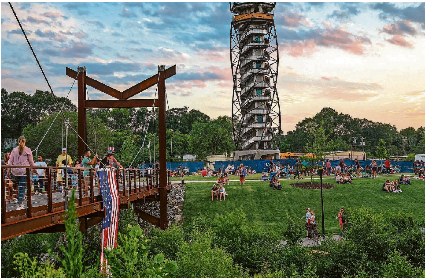
Honor Tower at Unity Park in Greenville. July 3.