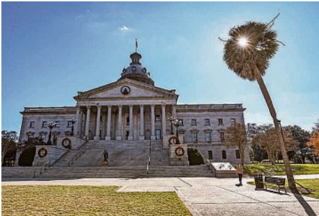
The South Carolina State House in Columbia, S.C. on Dec. 3, 2024.