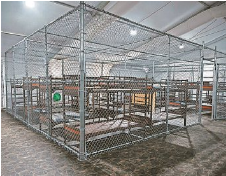
Beds inside a migrant detention center, dubbed “Alligator Alcatraz,” as President Donald Trump toured the Ochopee, Florida, facility July 1.