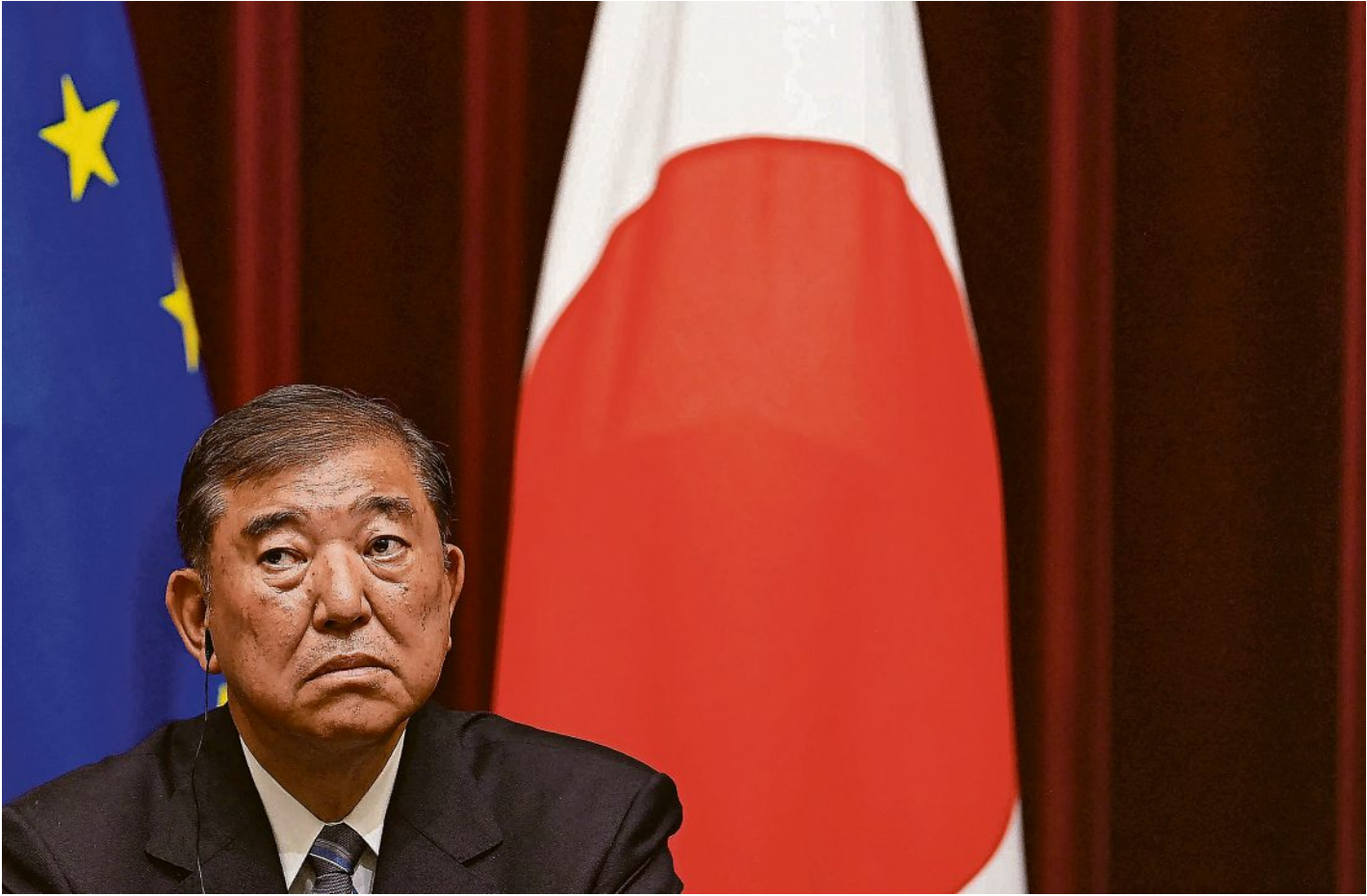
Japan's Prime Minister Shigeru Ishiba sent a trade negotiator to Washington, DC, to broker a deal with President Donald Trump on tariffs.