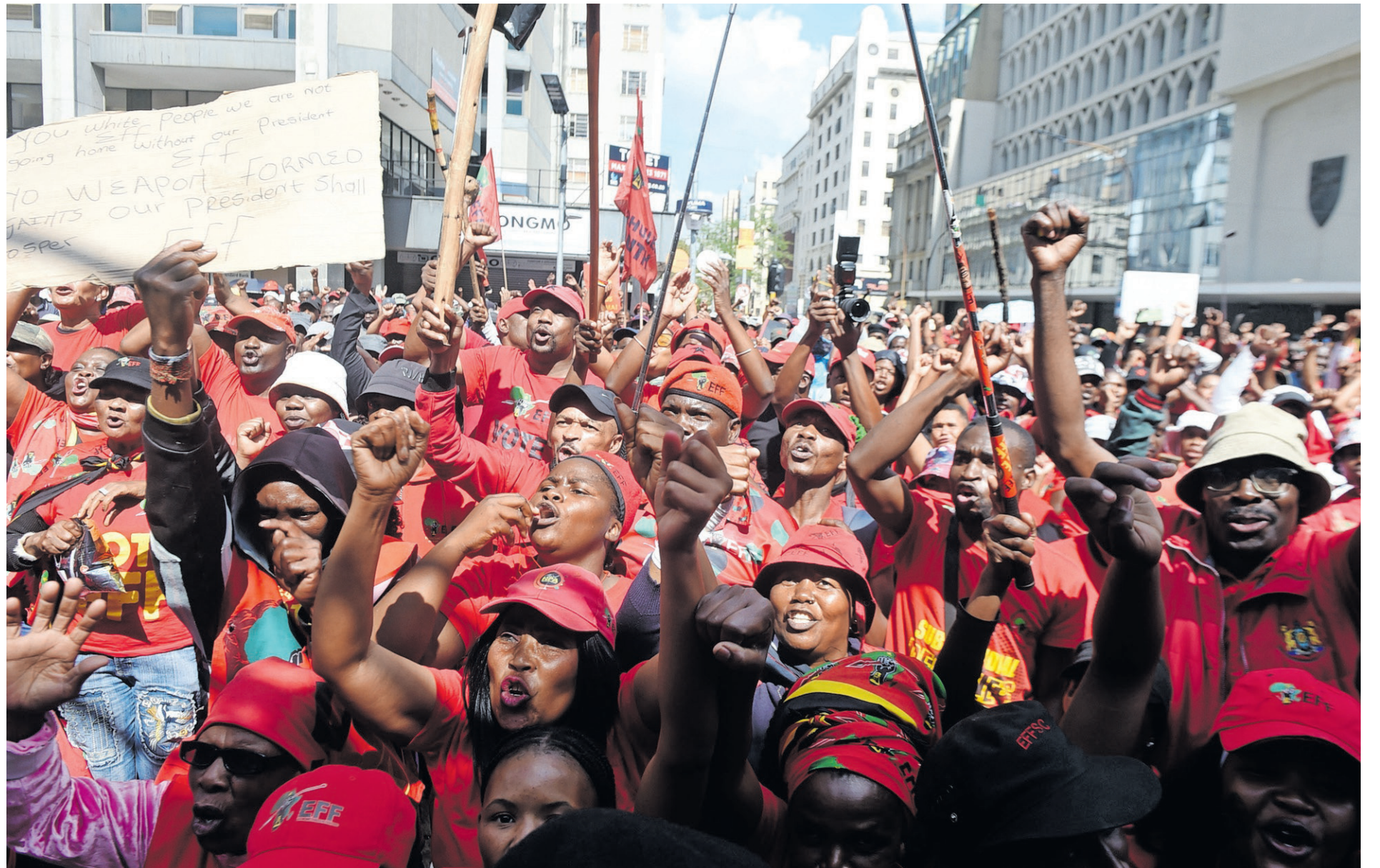
ECONOMIC Freedom Fighters (EFF) supporters marched outside the Johannesburg High Court to support their leader, Julius Malema, who received a five-year sentence for the unlawful possession of a firearm in the East London Magistrate's Court.

Meanwhile, AfriForum and the DA said the sentence also sends a clear message that in South Africa nobody is above the law.