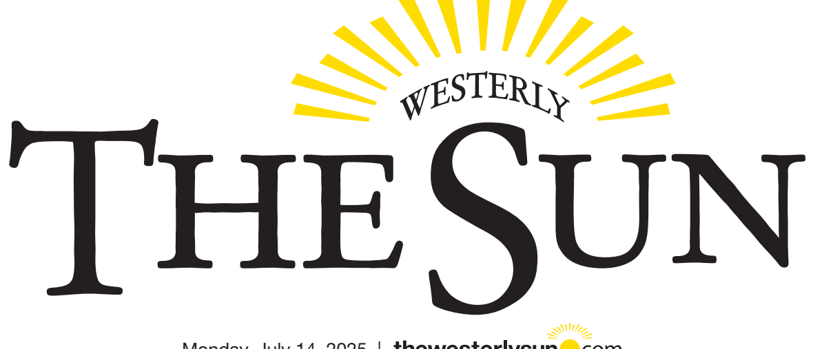
Monday, July 14, 2025 | thewesterlysun com