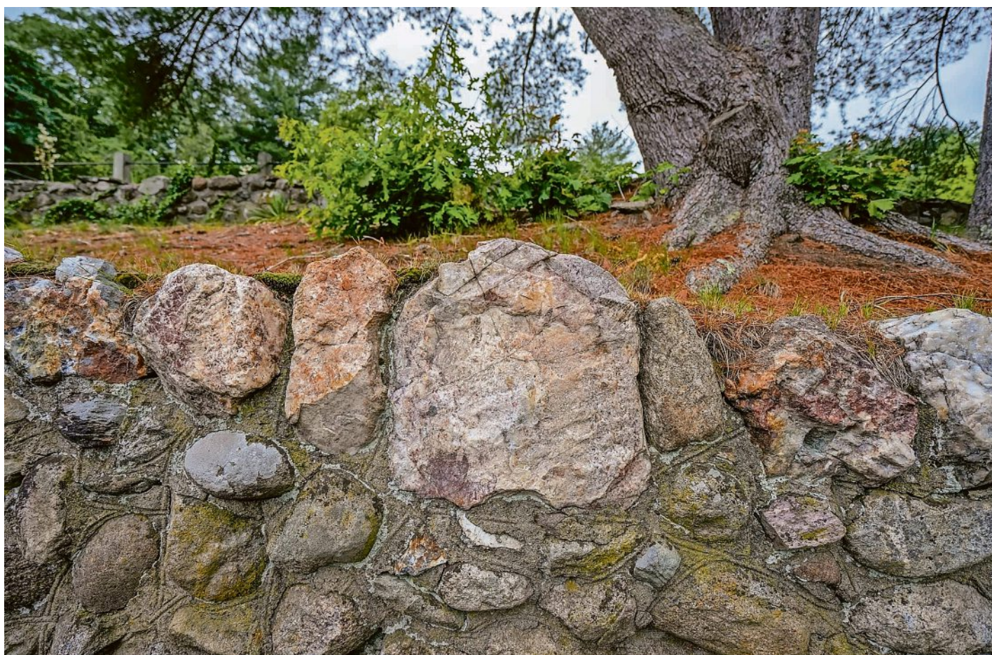
A closeup of the historic stone wall at Peck Cemetery in Cumberland from the mid-18th century, seen on July 6.