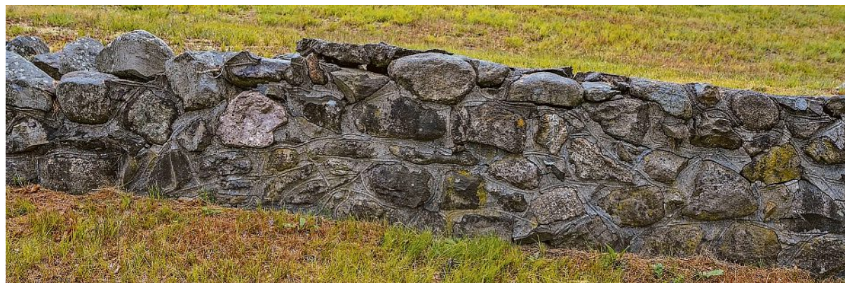
A stone wall from the mid-18th century at Peck Cemetery in Cumberland. Cumberland plans to do an inventory to better determine how many stone walls it has, how old they are and what types they are.